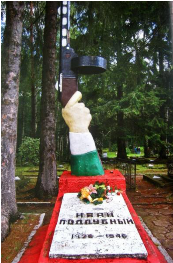
Fig. 2. The Russian cemetery in Borne Sulinowo

niopomorskie province, in the district of Szczecinek. It is an urban-rural commune with an area of 484.5 km 2 . The commune lies at the interface between three mesoregions: two lake districts (Pojezierze Szczecineckie, Pojezierze Drawskie) and the Wałecka Plain. Situated in the western part of the commune is Komorze Lake, which borders with the Drawsko Landscape Park. A nature reserve, called “Bagno Ciemino” covers an area of about 400 ha in the north-eastern part of the commune. The commune boasts a number of canoe routes: from Lake Pile through Lake Komorze to Lake Drawsko, from Wałcz through the Piława River, Lake Pile (adjacent to Borne Sulinowo), Lakes: Ciemino and Radacz, and channels to Lake Trzesiecko. There are also a number of cycling routes including the black Nizica Cycling Trail in Bagno Ciemino reserve, the green cycling trail (Szlak Wzniesień Moreny Czołowej), along the southern shore of the Ciemino Lake. Numerous military facilities are by far the main tourist attraction, including the almost 8-kilometre-long historic bicycle and walking path that takes visitors on