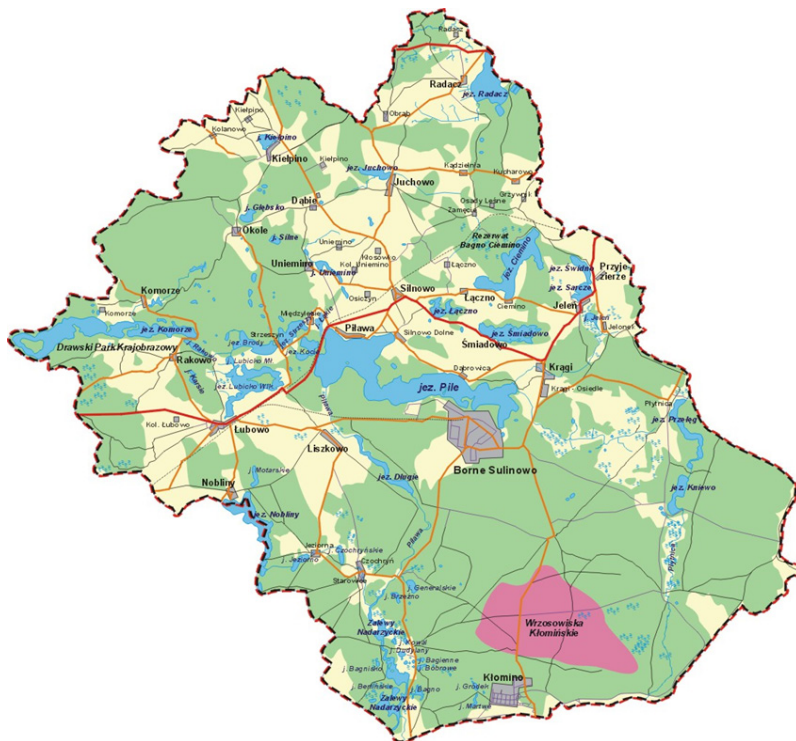
Fig. 1. The commune of Borne Sulinowo