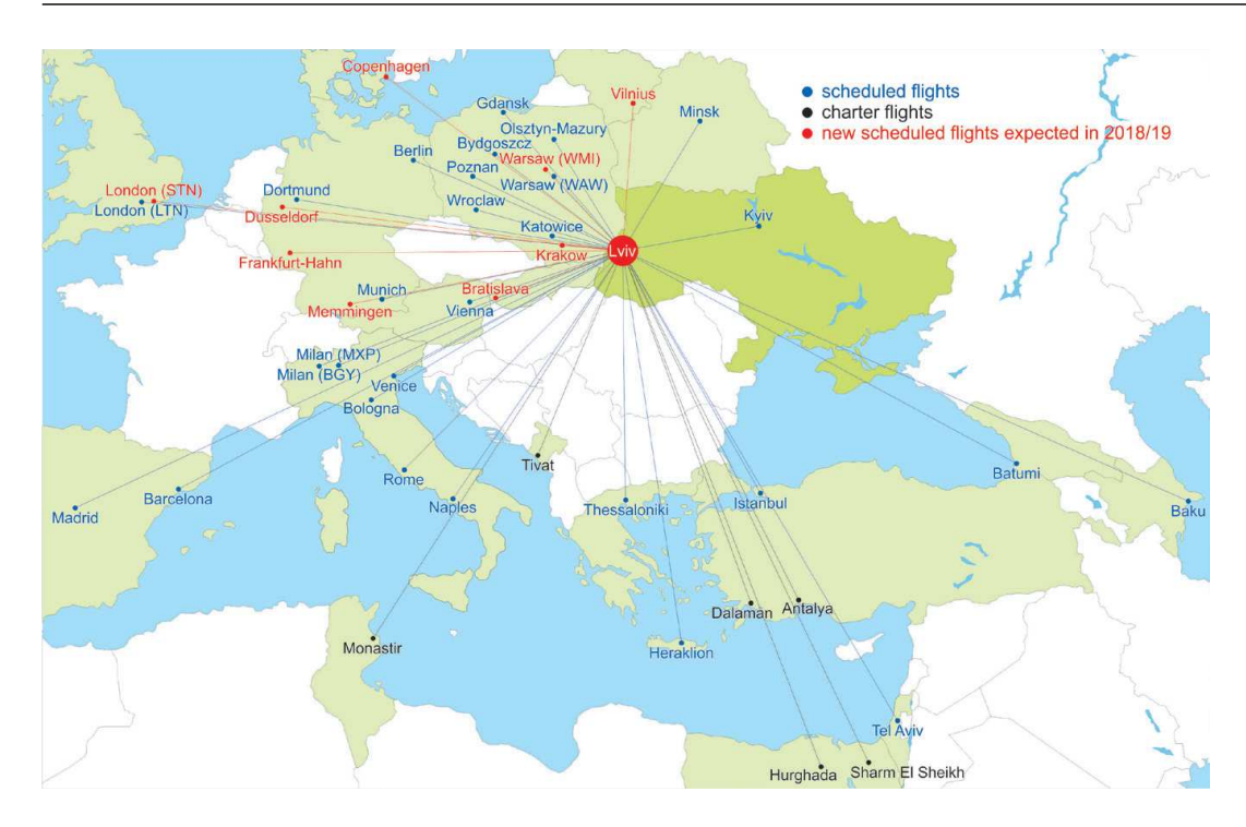
Figure 1. Direct international regular flights from Lviv airport